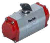
Output Torque 50 to 44,130 lb-in at 80 psi