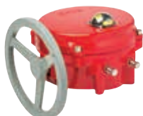
Output Torque 300 to 18,000 lb-in