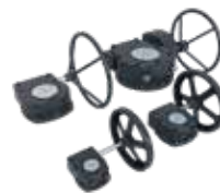
Output Torque 5,310 to 70,000 lb-in